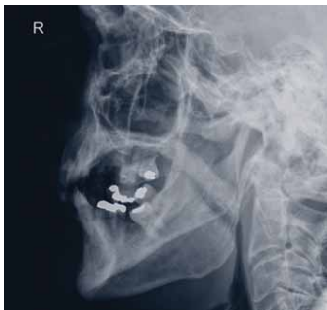
FIGURE 2: Lateral mandible at presentation. Note the poor upper and lower dentition.