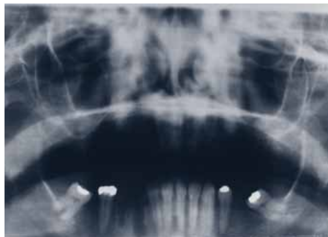
FIGURE 3: OPG post extraction showing healing sockets.

Empiric therapy with meropenem, vancomycin and IV dexamethasone was commenced. The patient underwent craniotomy